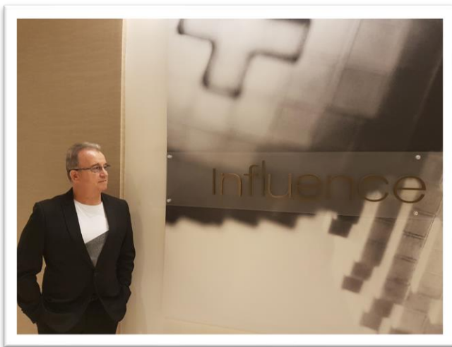
LAS VEGAS USA 2016