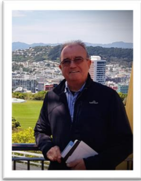
Wellington New Zealand Oct 2022